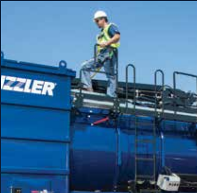
Standard ladder, catwalk, and railing