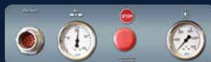
Control box with E-Stop

The standard emergency stop (E-Stop) circuitry on the CL cuts power to disable the vacuum and hydraulics, and throttles the chassis engine down to idle. The Guzzler E-Stop is designed to protect both the equipment and operator by bringing equipment to a safe condition. For improved module grounding, the debris body, sub-frame and chassis are fully connected via a copper grounding strap, while an improved grounding cable clamp grounds the module components to their grounding location.