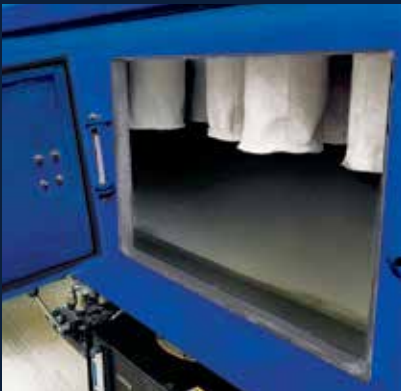
Larger baghouse access doors