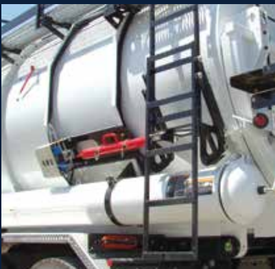
Ground level maintenance