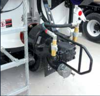
Rear door mounted sludge pump

The Guzzler CL modular design allows you to select an offloading solution for your specific needs, so you get minimal downtime and maximum productivity. Guzzler offers the widest selection of configurations of any manufacturer.