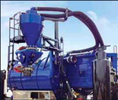
XCR swing-out cyclone