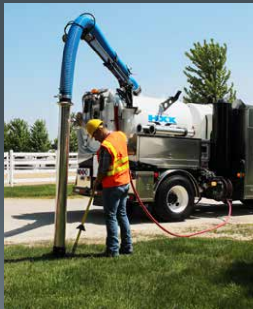
Standard wireless boom and air compressor

**Capacity rating on a non-CDL class 6 chassis. Legal capacity can be optioned up to 8200 lbs on a class 7 chassis. Actual capacity is dependent on chassis configuration and tools stored on the unit.