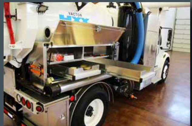
Lockable overfender toolbox with slideout tray