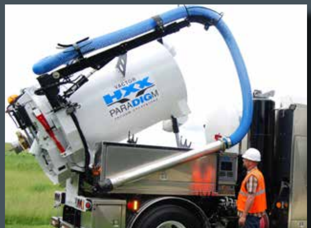
Raising debris body