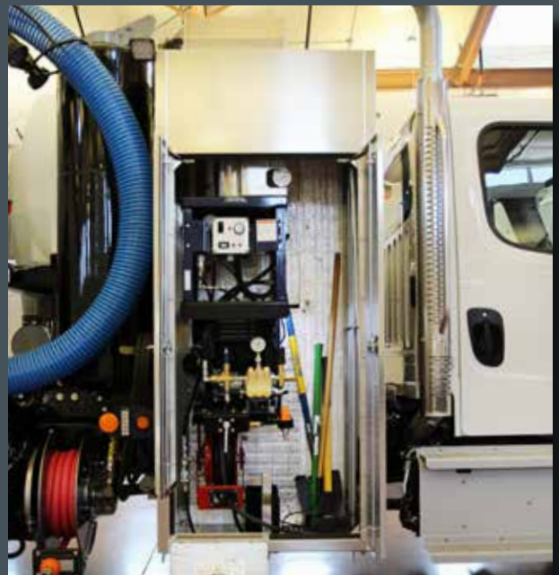
Large vertical storage cabinet