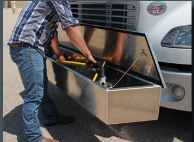
Optional front bumper tool storage