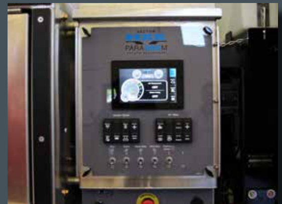
Bluetooth connectivity for service support