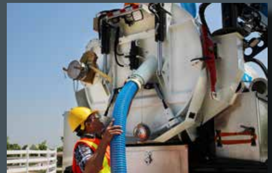
4" rear loading port